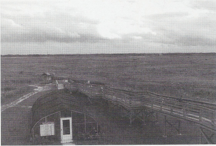
Goose Lake Prairie State Natural Area contains the largest tract of tallgrass prairie in the state.

Unfortunately, Illinois's agricultural dominance has come at a cost. With only 0.5 percent of the state's surface area remaining as tallgrass prairie, it seems the Prairie State nickname is now a misnomer.